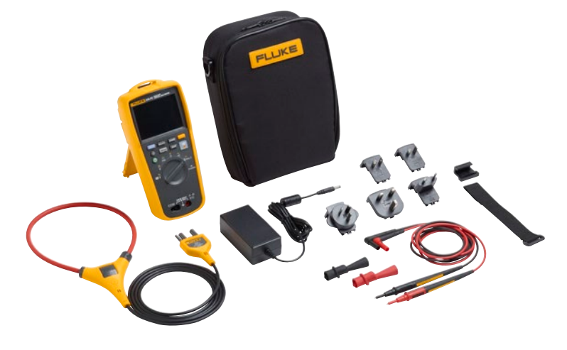
Figure 2. Fluke 279 FC/iFlex TRMS Thermal Multimeter Kit