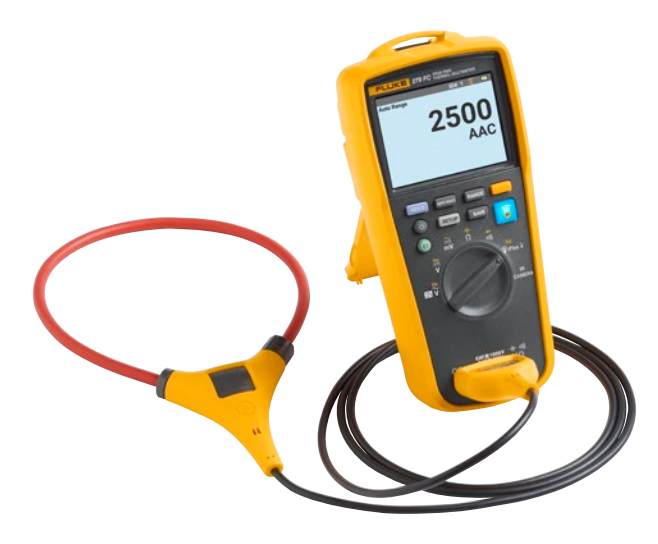
Figure 1. Fluke 279 FC with the iFlex Flexible Current Probe